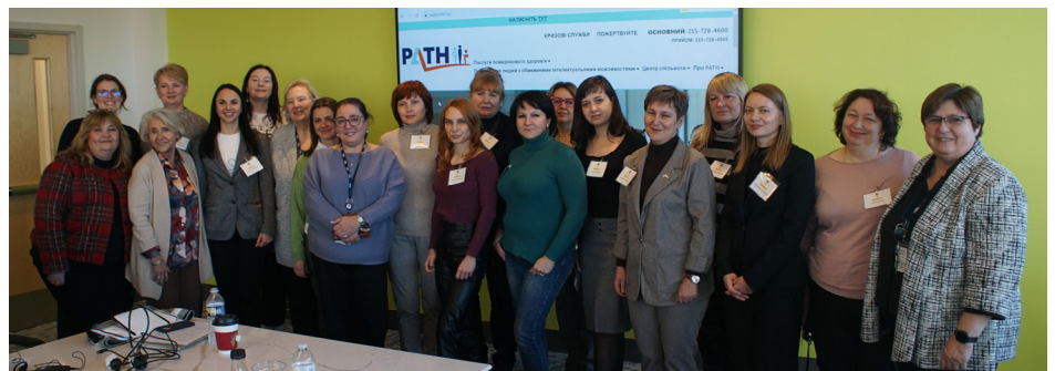
Members of the Ukrainian delegation with PATH leadership and program team members.

In December 2023, PATH was selected by DBHIDS to host a delegation of 22 behavioral health professionals from Ukraine, who are delivering services under the most difficult circumstances. In sharing how we serve adults, adolescents, children, and families and in listening to their experiences, they were able to experience the very best of PATH.